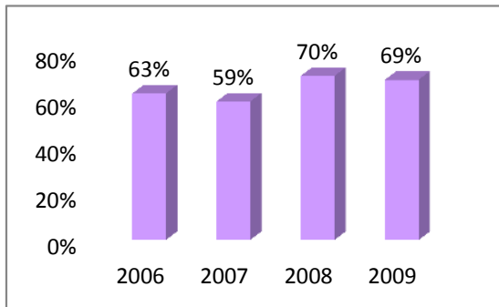
RETURNED 2ND YEAR