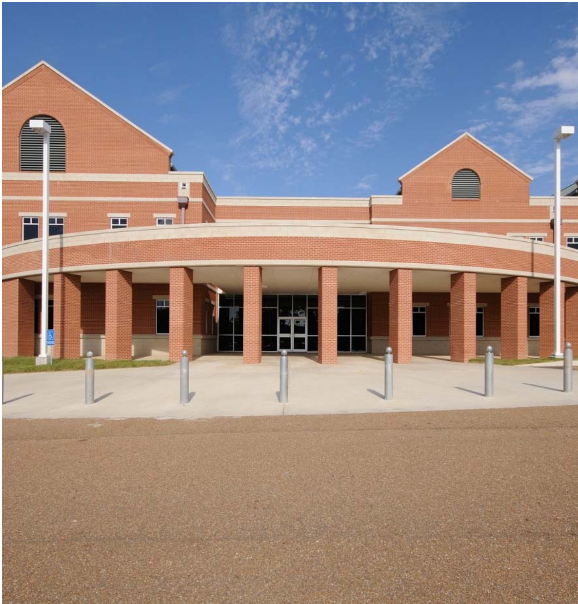
School of Agriculture, Research, Extension and Applied Sciences